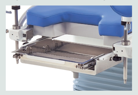
The procedure tray is equipped with a mesh plate to prevent body fluids and cleaning solution that splash over a wide area.